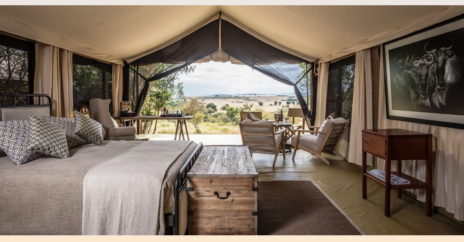
The camp has 8 luxury tents situated at the shores of Lake Naivasha with spectacular and breathtaking views of the Lake and its serene surrounding and is complimented with large tents that feature double vanity, private terrace deck. The Luxury camp is a truly relaxing and fulfilling one stop destination, ideal for romantic honeymoon and enthusiastic travelers alike, Experience rich African Luxury in total decadence.