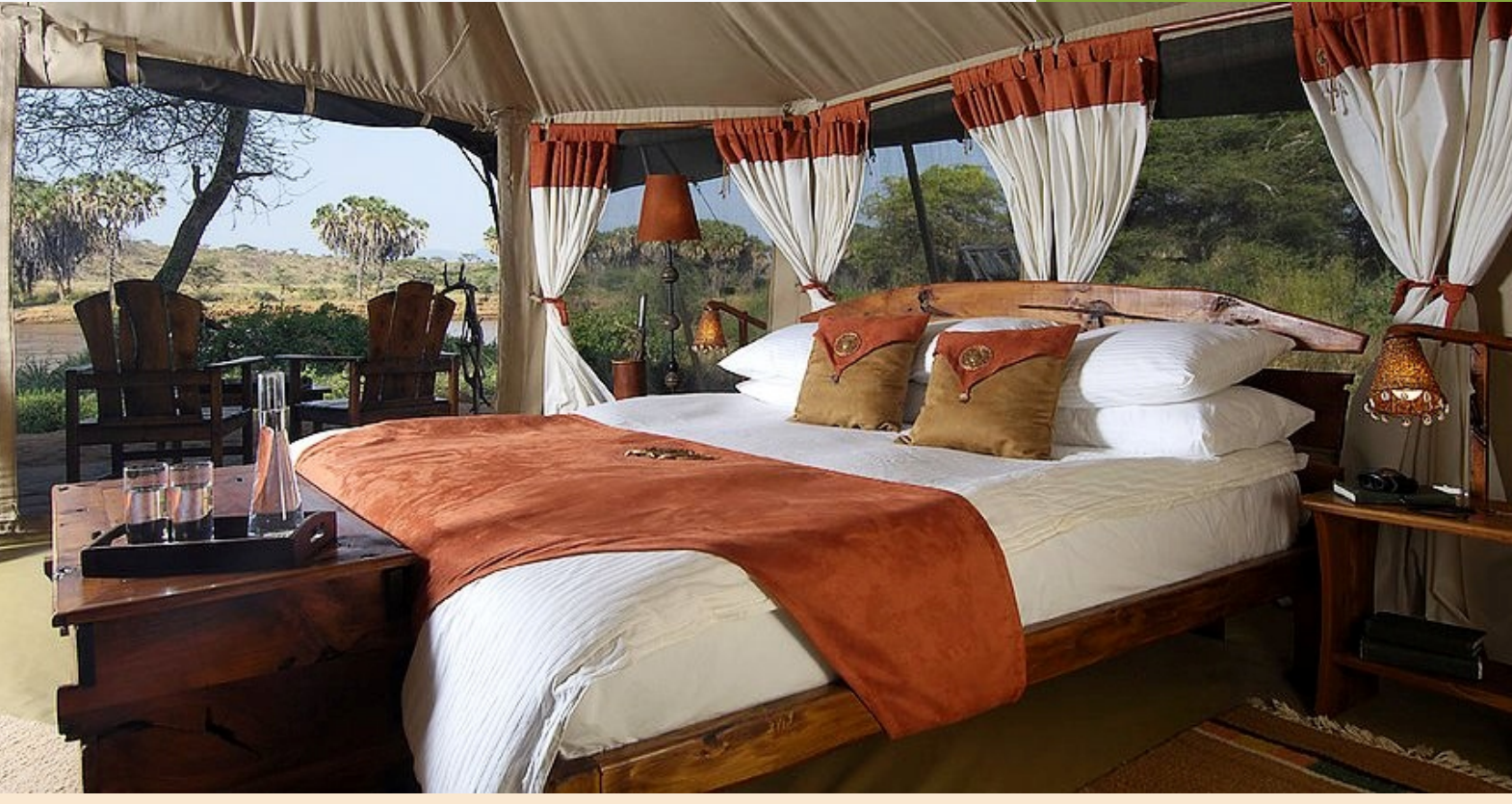
Elephant Bedroom Camp offers luxury in a setting of breath taking beauty. It is set along the banks of the Ewaso Nyiro River and shaded by doum palms and other trees that make up this green belt of riverine forest in Samburu National Reserve. The 14 spacious tents have rustic and colourful African touches, offering all the comforts; including a private plunge pool on the deck, hot and cold running water, electricity (and complimentary herbal shower and bath products.)