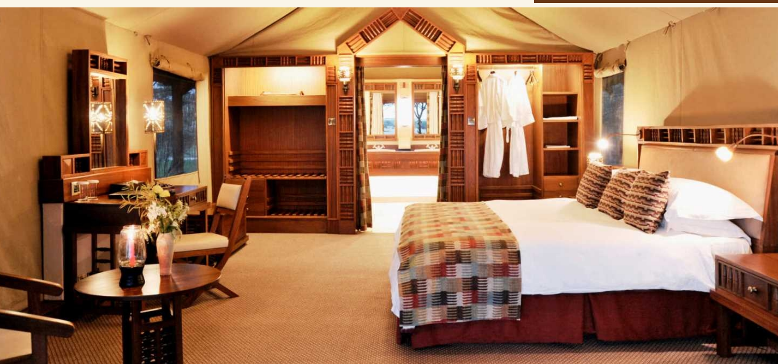
Boasting views of Mount Kenya, the new Morani Wing features 17 deluxe double, twin and triple tents, one of which is specially adapted for guests with mobility concerns. Bathrooms include a two-hand washbasin, a WC and a shower with a glass door. In room amenities include free Wi-Fi, premium bath amenities, work desk and chair, coffee/tea making station, robe, hair dryer, safe (located in manager's office), private balcony or veranda